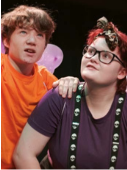
Coram's Shakespeare Schools Festival – the world's largest youth drama festival

“350 years ago, Thomas Coram challenged the prejudice of a society which tolerated child poverty and abandonment as necessary evils. The work of Coram for children today is just as vital as it was 350 years ago, because real issues still persist in the 21st century.”