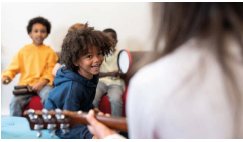
Music therapy is one of the many programmes offered by Coram's Creative Therapies team