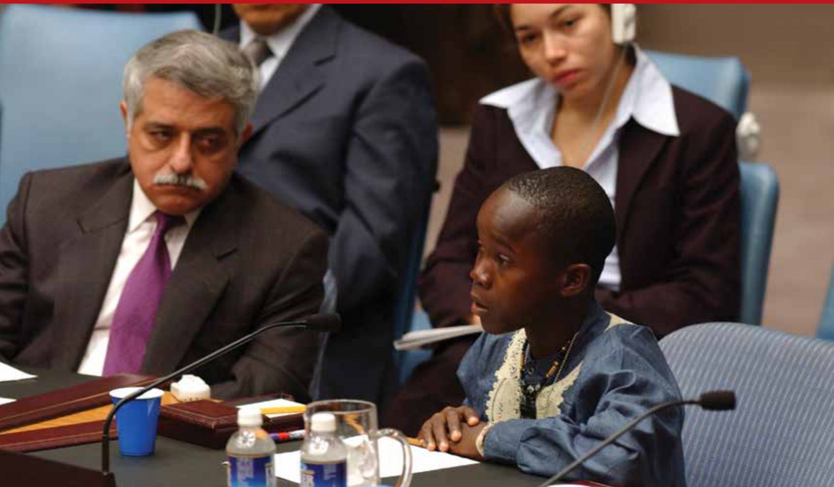
Wilmot, 16, a boy delegate from Liberia, testifies on the impact of war on children, at a special meeting of the Security Council, New York, 2002.

the United Nations Guidelines on Justice in Matters involving Child Victims and Witnesses of Crime (2005) 29 including the right to be treated with dignity, to be protected from discrimination, to be informed and to be heard, to be protected from hardship and intimidation, and to receive effective assistance.