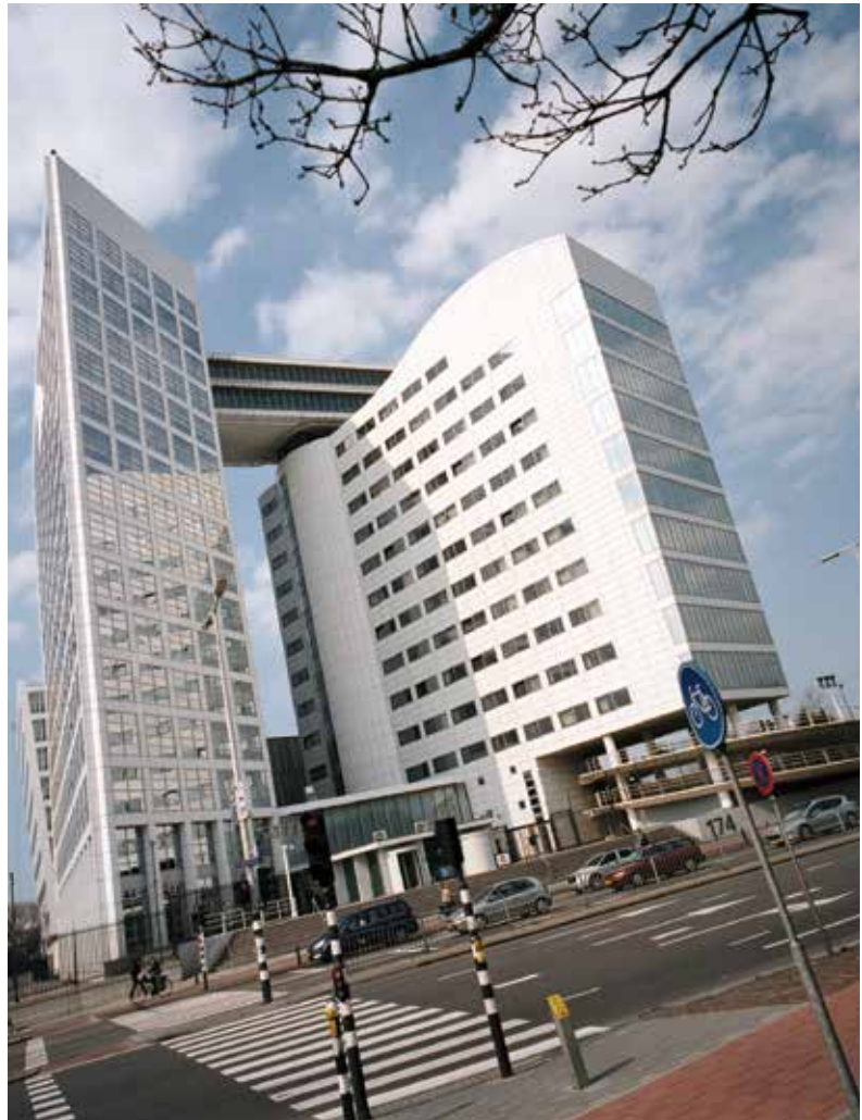
ICC Building. The Hague, Netherlands.

Few children have appeared as witnesses in international tribunals and hybrid courts. There are a number of reasons for this. First, few trials, until recently, have involved violations against children; second, frequently there is a significant time lapse between the end of the conflict and the starting of a trial, by which time the child has become an adult; third, international criminal prosecutors are often reluctant to rely upon the