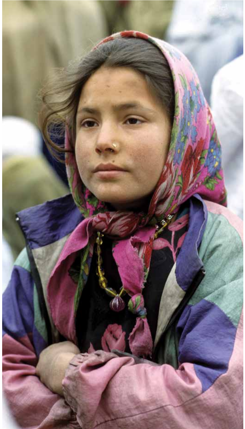
An Afghan girl at Gudham Shahr Camp in Mazar-i-Sharif.