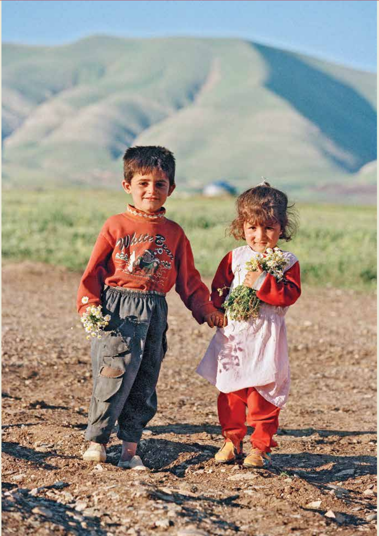
Children in an internally displaced persons' camp near Suleimaniyah holding bouquets of flowers, Iraq.