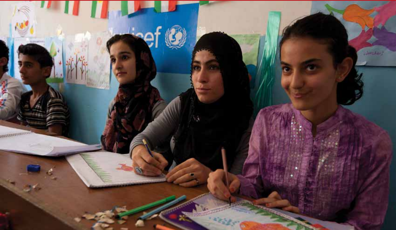
Children of the Halshoo Village in Sulaymaniyah Governorate participate in the summer programme offered by UNICEF to learn about the dangers of mines and unexploded ordnance (UXO), Iraq.

Most reparations programmes limit the violations for which reparation is possible and limit the eligibility to those registered as victims or, in some cases, to witnesses before a commission or court. 59 The crimes or harms qualifying children for reparations have varied: from children who escaped acts of genocide and persecution and who are in need (Rwanda); to children born in detention and child victims of forced marriage, sexual mutilation, rape, amputations, psychological trauma, or recruitment into fighting forces (Sierra Leone). 60