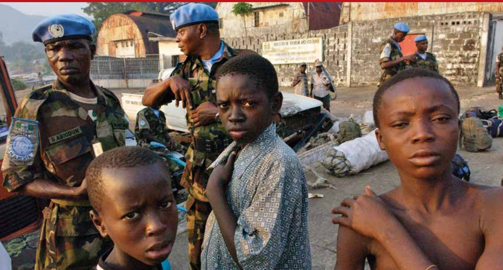
Orphaned and homeless children who live at the Ferry Port in Lungi begging for money and food from the departing United Nations Mission in Sierra Leone (UNAMSIL) Nigerian contingent, Sierra Leone.

3. Protective measures: As with children who are witnesses before the Court, the Victims and Witness Unit of the ICC also provides support and protective measures to children granted victim status. The protective powers of the Court include almost the same measures as for child witnesses giving evidence; the Court can hold the hearing in camera and can order measures which will prevent the public or press identifying the victim's name or place of residence. Both victims and witnesses are allowed to remain anonymous for protection reasons. 37