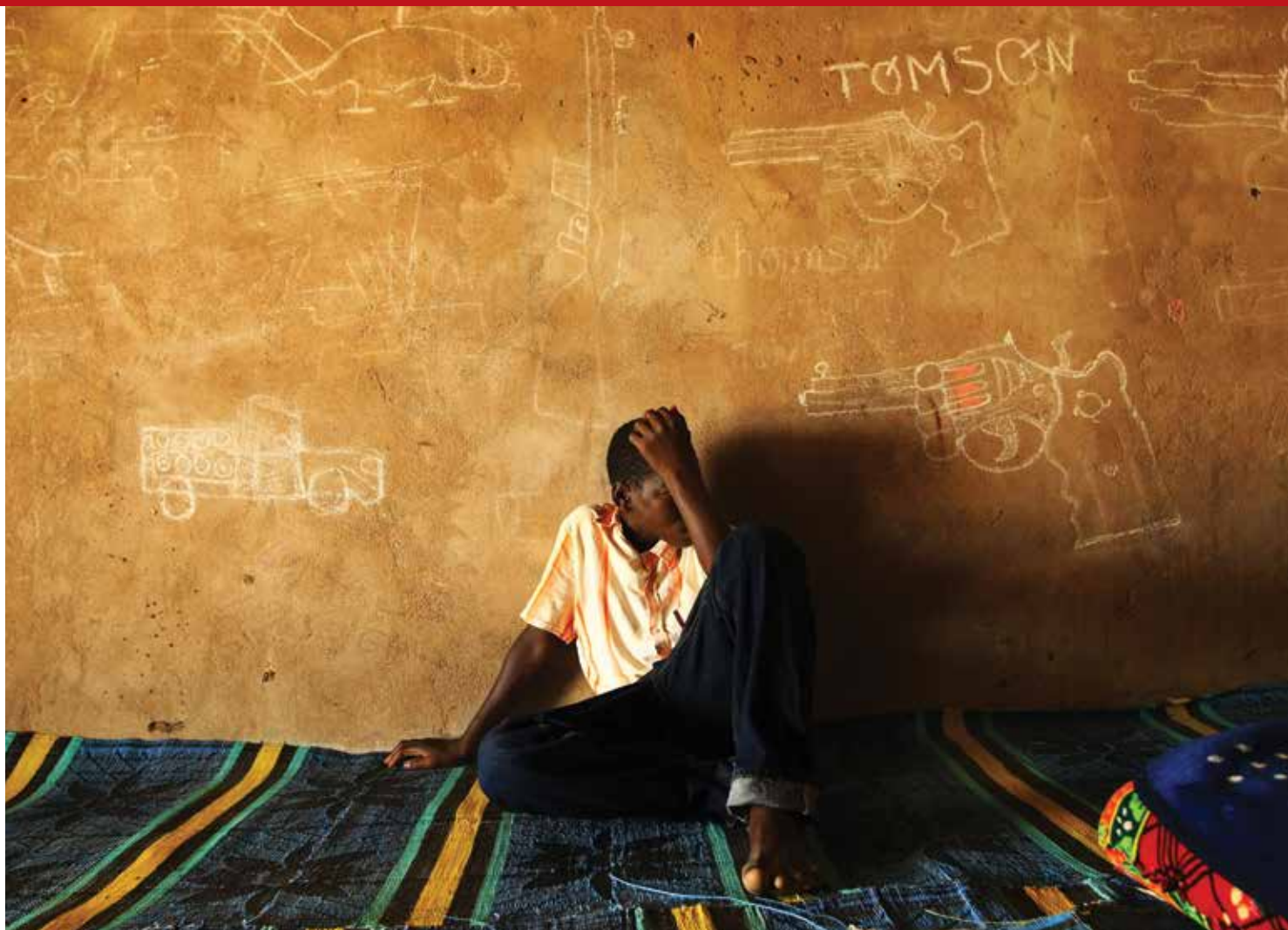
A boy sits against a wall covered with drawings of weapons, Chad.

jeopardise the security of the State by other means, such as sabotage or espionage. 90