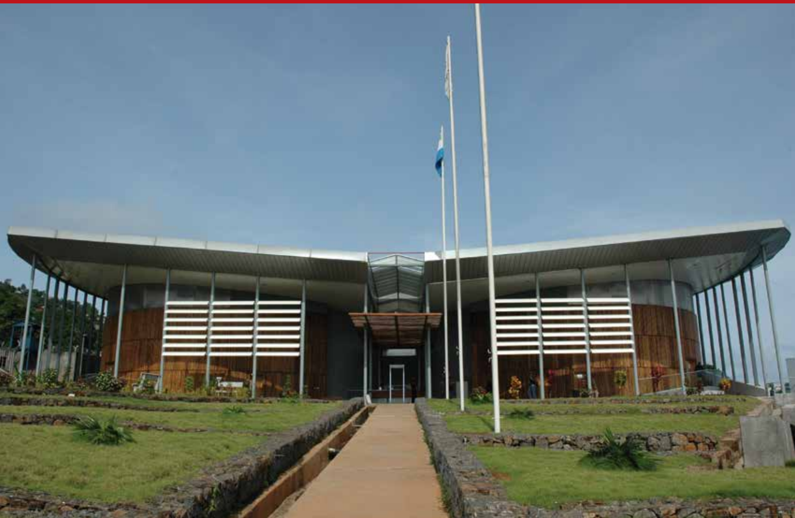
Special Court for Sierra Leone.