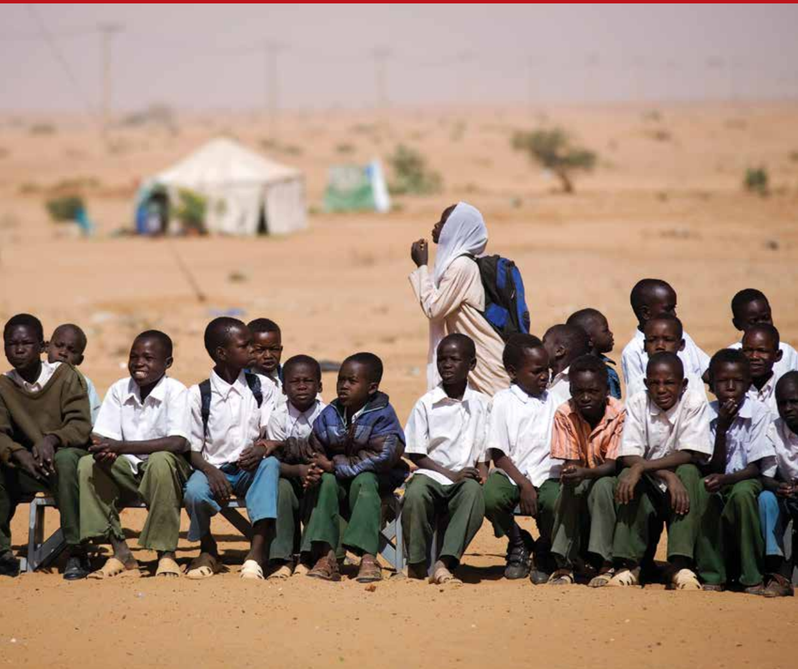
Pictured are boys from the Shallah Juvenile Home, a rehabilitation centre for juvenile offenders, in El Fasher, North Darfur, Sudan.

ings and values, and, often, an acknowledgement by the child of the harm or suffering that he has caused by his actions. This acknowledgement is sometimes achieved through traditional healing mechanisms or through negotiation with community leaders. In some cases, like in other forms of justice previously mentioned, the child is encouraged to make reparations through voluntary work in the community, assisting those who have been made vulnerable as a result of the conflict.