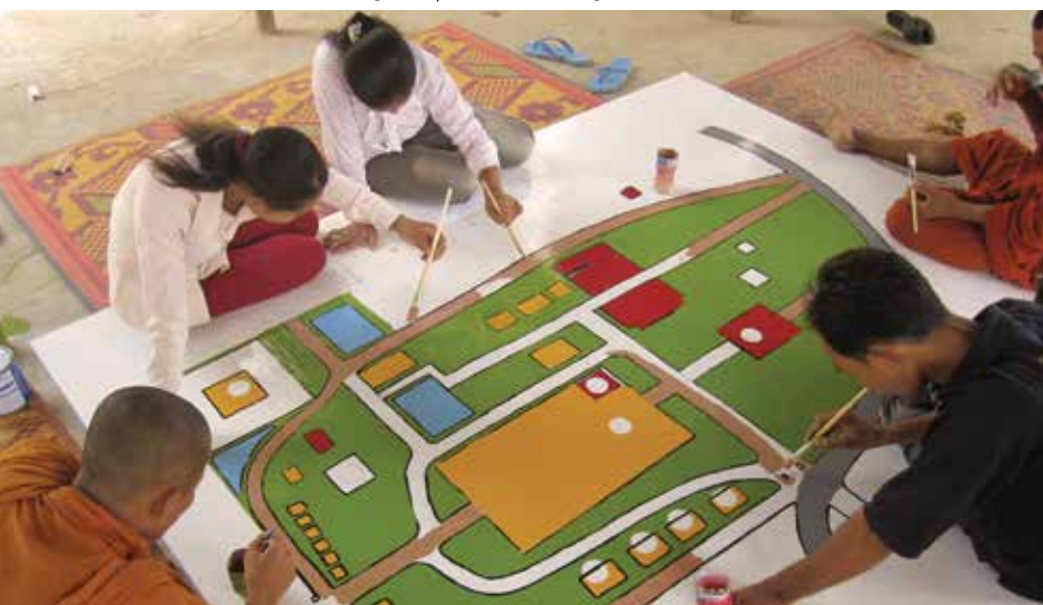
Young people involved in the process of memorialization, inter-generational dialogue and making a map of a mass killing site, Cambodia.

The Act also required child rights experts to be employed to enable children to provide testimony to the TRC and the implementation of special mechanisms to handle child victims and perpetrators, not only to protect their dignity and safety, but also to avoid re-traumatisation and to ensure that their social reintegration and psychological recovery was not endangered or delayed. 41