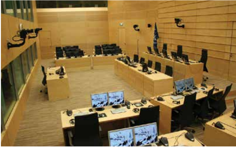
ICC Courtroom. The Hague, Netherlands.