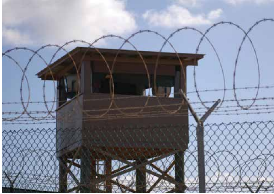
Camp Delta, Joint Task Force Guantánamo Bay, Cuba.

serve hearings before military courts and tribunals involving children associated with an armed force or armed group;