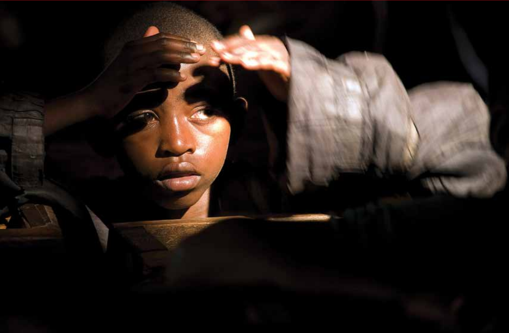
Orphaned and homeless children who live at the Ferry Port in Lungi begging for money and food from the departing United Nations Mission in Sierra Leone (UNAMSIL) Nigerian contingent, Sierra Leone.

on children. It is clear that children will be disappointed with an approach that focuses strictly on violations such as recruitment, abduction or forced marriage, and does not acknowledge harm done to them by the loss of education, family and childhood.