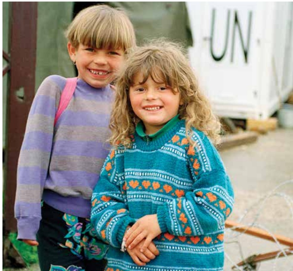
Muslim children in Vitez, Bosnia and Herzegovina.