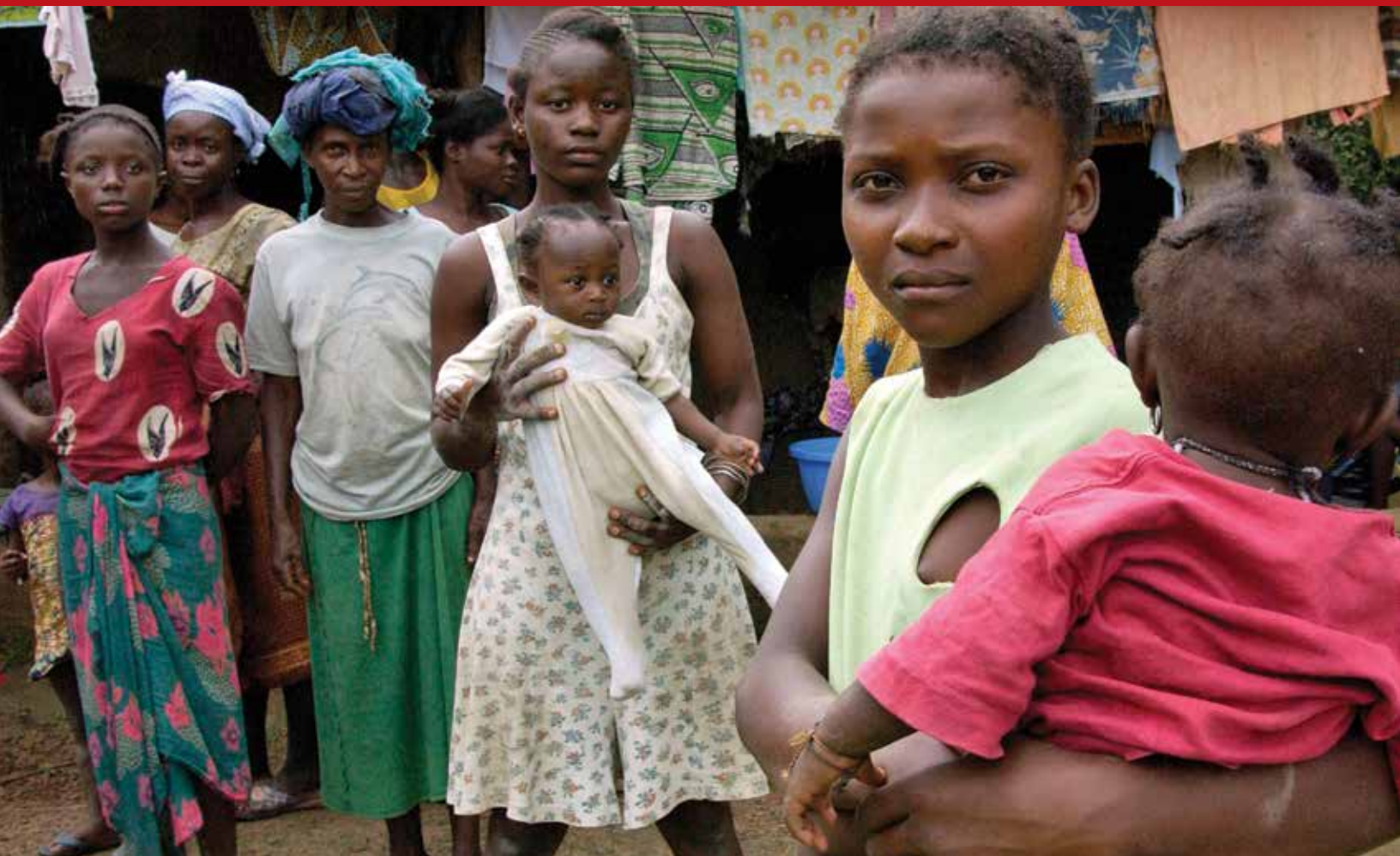
Villagers await the return of family members and friends who have been living as refugees in a Liberian refugee camp, Camp David in Western Liberia for more than a decade, Kenema, Sierra Leone.