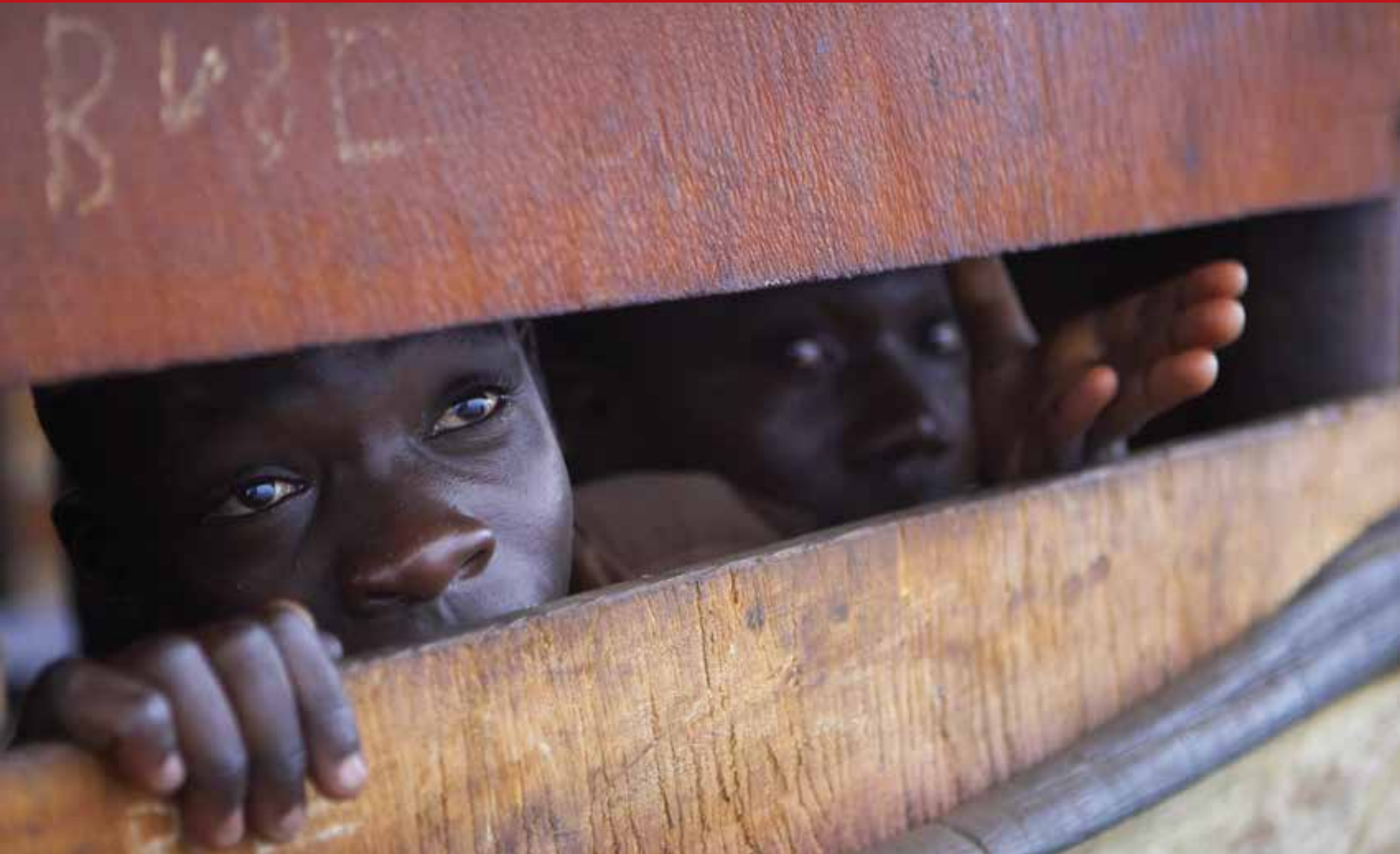
Centre for demobilised former child soldiers, South Kivu province, Bukavu, Beves, Democratic Republic of the Congo.

Commentators have held that such a reading of Article 77(2) is not supported by the text itself, which makes no direct reference to a minimum age of criminal responsibility of child soldiers. 114