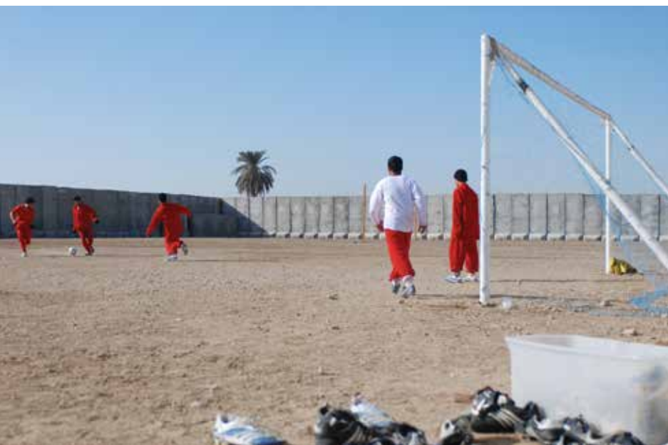
Juvenile detainees play soccer during their recreation time at the Dar al-Hikmah juvenile education center in western Baghdad, Iraq.